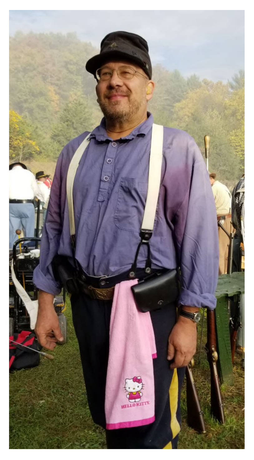
June 3-5, 2022

@ Fort Miller, Springtown, Pennsylvania3146 PA-212, Springtown, PA 18081